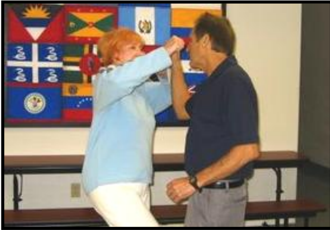
First Responders from CAP Senior Practicing Self-defense

Self-defense situations involve two separate and distinct stages, the “ Pre-conflict Stage and the Engagement Stage. ” The Pre-conflict Stage refers to changes in the environment that gives the individual a series of indications or signals that something is about to happen. The second stage, The Engagement Stage , refers to the actual confrontation. Consequently, for any self-defense centric fighting strategy to be effective it must address both stages.